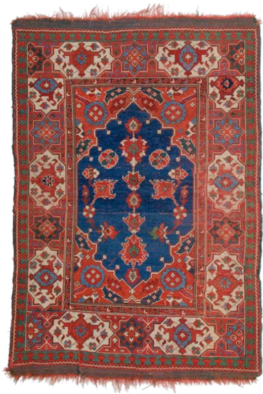
◀ Transylvanian double niche rug 5ft. 4in. x 3ft. 11in. Turkey 17th century Condition: corrosive black, even low pile, some short fold lines, original green kelim ends Wool warp, wool weft, wool pile Sold for 54.900 €