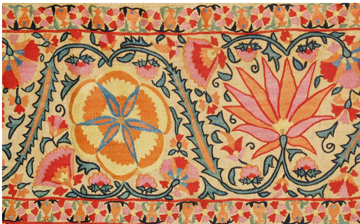
Rare silk embroidered Suzani, detail of border, mid 19th century.