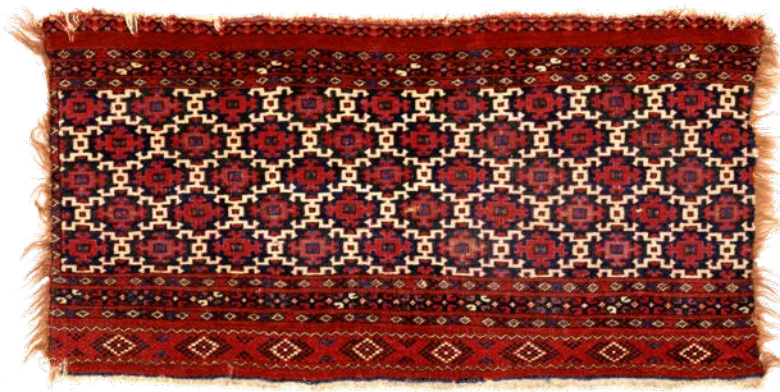
Salor Torba ▶ Turkmenistan early 19th cent. 1ft. 06in. x 2ft. 10in. Condition: cut on both sides with loss of entire right border and most of the left, three splits or weak areas along the top edge, overall central wear. Sold for 19.520 €